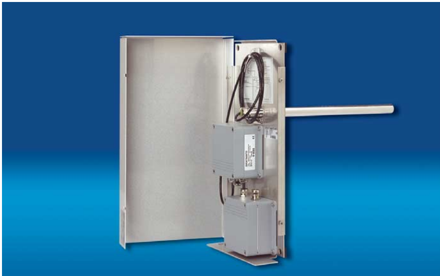
Vaisala HUMICAP® Dewpoint Transmitter HMP247T shown with the cover open.