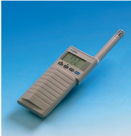
The HMI41 indicator with the HMP41 probe.