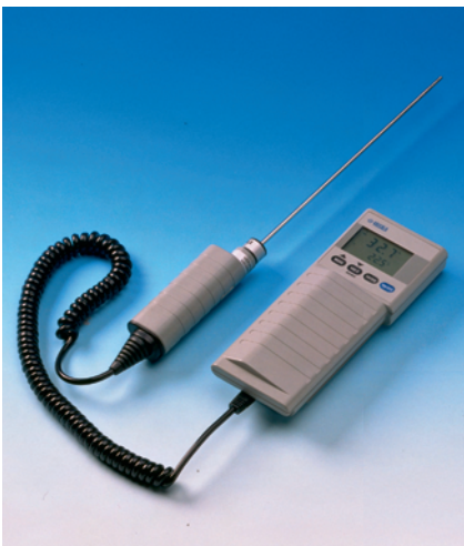
HMI41 with the HMP42 probe.