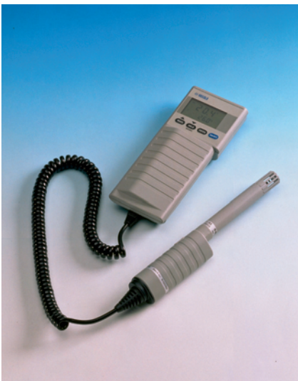
HMI41 with the HMP45 probe.